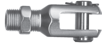
Head Cabeza Testa