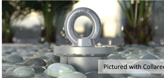
Pictured with Collared Eyebolt